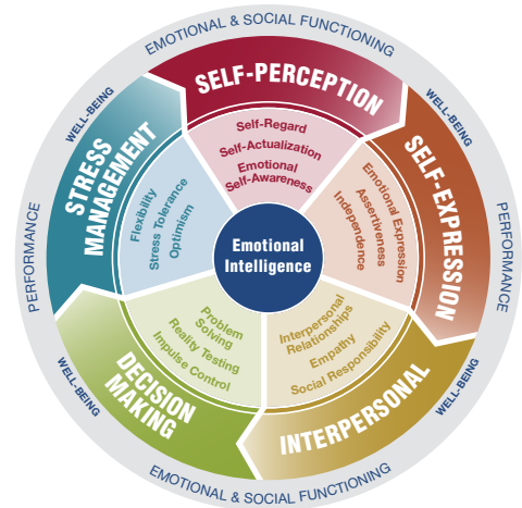
Copyright © 2011 Multi-Health Systems Inc. All rights reserved. Based on the original BarOn EQ-i authored by Reuven Bar-On, copyright 1997.

The EQ-i 2.0, the most scientifically-validated EI assessment available, is proven to measure a person's Emotional Intelligence accurately. Certified feedback professionals use EQ-i results to help clients understand EI strengths and to provide coaching on areas that require focused attention (see Model).